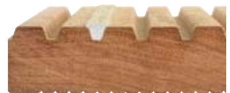
Detail of SafeGrip®